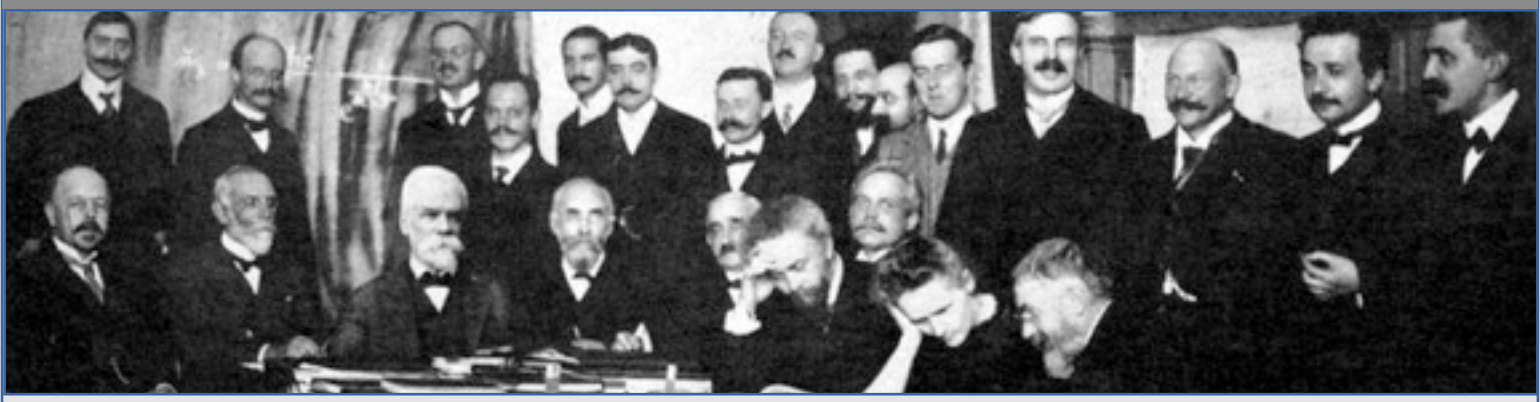
Solvay Conference 1911 ~ Can you spot Marie Curie and Albert Einstein? For more more information visit: wikipedia.org/wiki/Solvay Conference